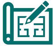
Program Design / Admin

The EHF covers the following costs for the battery program: