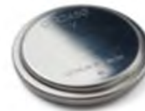
Single Use Lithium Primary