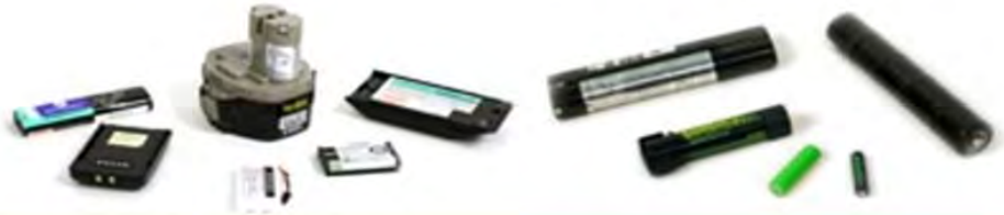
(Ni-MH) Nickel Metal Hydride