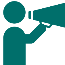
Public Education & Awareness