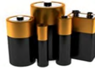
Single Use Alkaline