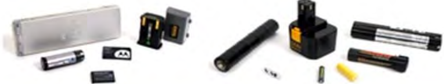
(Li-Ion) Lithium Ion